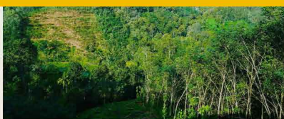
Forest Tour Package

In the calm village of Amboori, blessed with hills, rivers, and waterfalls, Thanal Homestay offers you the warmth of a home and the beauty of nature. Licensed by Kerala Tourism, this is the perfect place to relax, explore, and experience village life.